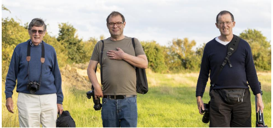
A trio of intrepid photographers!

Some links to websites and YouTube videos that you might enjoy.