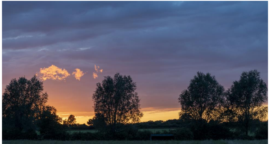
And the sights were well worth the effort!