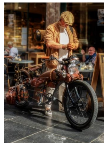
Retro Pedal Cycle