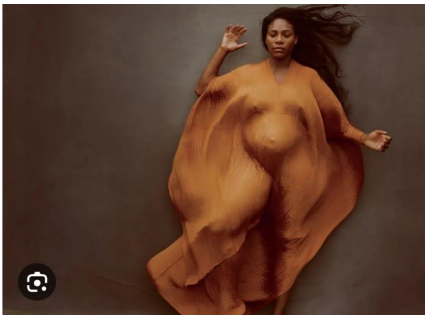
Serena Williams – not as we normally see her