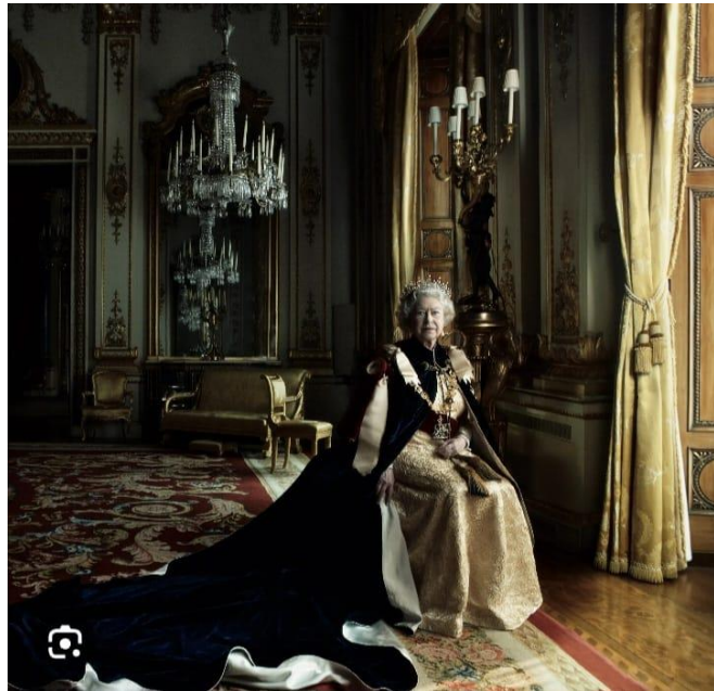
An rather different image of the Queen

Probably best known for her portraits of celebrities, American photographer, Annie Liebovitz never fails to surprise and impress. Her portraits are often intimate. Before developing her own inimitable style, she attended the San Francisco Art Institute, where she studied painting with the intention of becoming an art teacher. At school, she had her first photography workshop and changed her major to photography. She was inspired by the work of Robert Frank and Henri Cartier-Bresson.