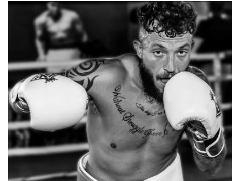
Boxers Past and Present