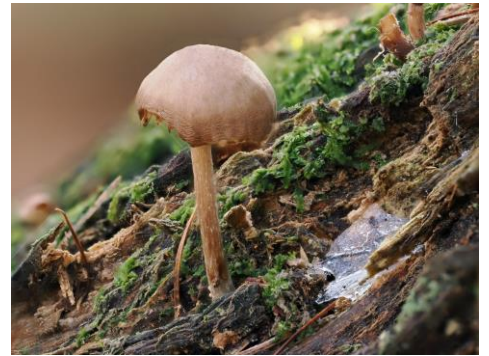
Mushrooms on Ice