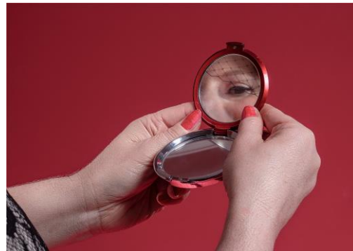
The Eyes Have it