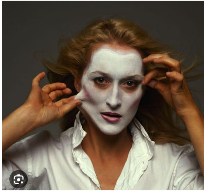
Meryl Streep – an unusual pose