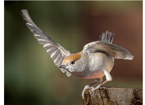
Female Blackcap - Chris