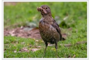
Peter's panel entitled "Feather Friends".