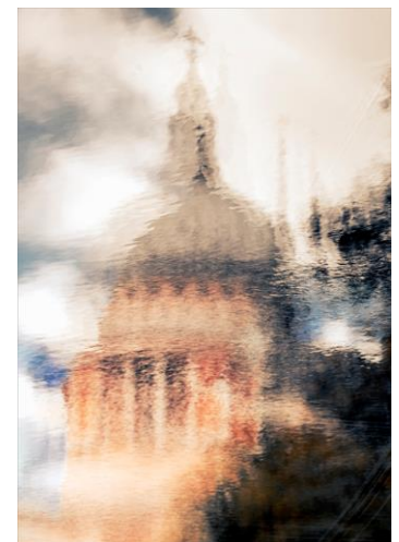
Reflections of St Paul - Aidan